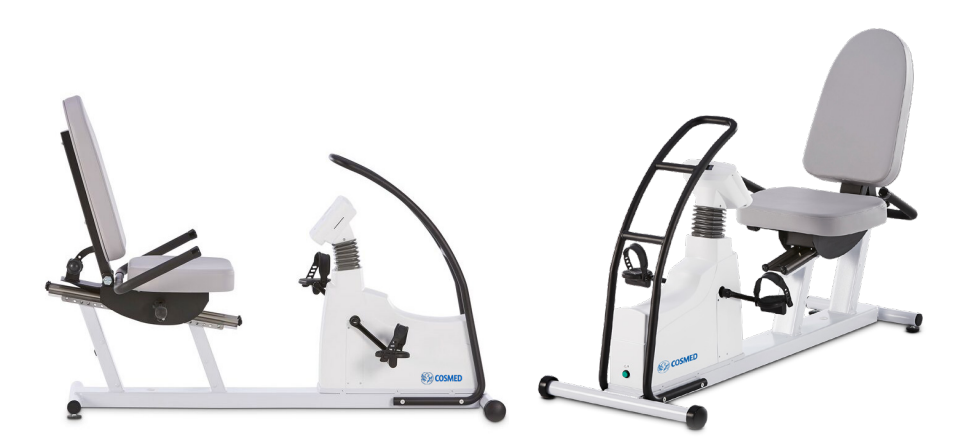
A sturdy support bracket made of tubular steel gives patients a secure hold while moving on and off the E600 ergometer.

E600 Recumbent cyclergometer designed for patient weight of up to 300 kg, it is Ideal for morbidly obese, elderly or handicapped patients. Details such as the 3-way adjustable backrest, special pedal shoes with adjustable pedal spacing and additional cushions that increase the distance between the pedal axis and the large seat surface enable optimal adjustment to every individual patient.