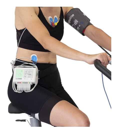
The Optibike Plus ergometer offers a wide range of expansion options.