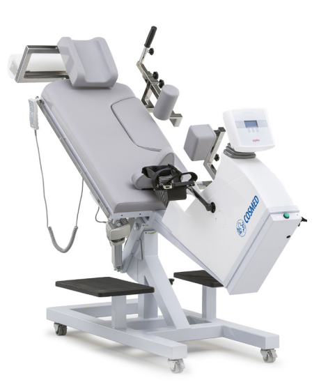
E1200, the classic tilt-recline ergometer for dynamic stress echocardiography examinations.

E1200 The classic tilt-recline ergometer for dynamic stress echocardiography examinations. The angle of inclination can be electrically set both horizontally and laterally between 0 and 45°. The drop section in the couch surface facilitates the ultrasound examination. Multiple adjustable support elements also provide the patient with stability in the lateral position.