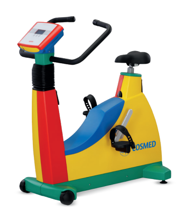
The colorful design of E150 Pediatric relieves children of their fear of the "medical device".

The modular design of the medical-grade ergometer incorporates state-of-the-art technology.